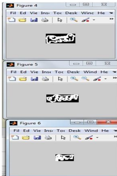
Figure 3: Selected components showing text written on the vehicle