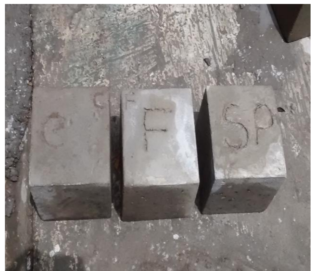
Fig.2 Sulphate attack on cubes

When concrete is exposed to environment containing aggressive chemicals, it leads to deterioration of concrete which can be assessed in terms of loss in weight of concrete. To study the acid resistance of concrete, the cubes of concrete were cured and then immersed in 5% Na 2 SO 4 solution up to 28 days. After 28 days of immersion, the specimens were taken out and visually observed for the deterioration of the concrete due to sulphate attack. The specimens were weighed once again and the weight was compared with normal concrete in order to calculate the percentage of loss in concrete and also the loss of strength.