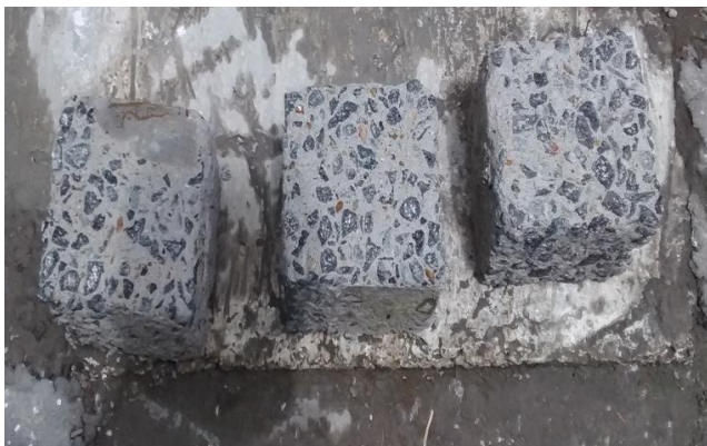
Fig.4 Acid attack on cubes

For acid attack test, concrete cubes of size 150 x 150 x 150mm were prepared. The specimens were cured in curing tank for 28 days. After 28 days, all specimens were kept in atmosphere for 2 days for constant weight. Subsequently, the specimens were weighed and kept immersed in 5 % sulphuric acid (H 2 SO 4 ) solution for 28 days. After 28 days of immersion in acid solution, the specimens were kept in atmosphere for 2 days for constant weight. After drying the cubes, the changes in weight were found and also the compressive strength of cubes was found.