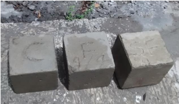
Fig.3 Chloride attack on cubes