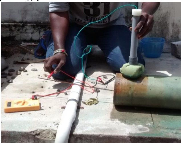
Fig.1 Half – Cell Potentiometer test

In the present study, the corrosion process was accelerated by impressing a constant DC voltage between the steel bar (as anode) and stainless steel plate (as cathode) and the variation of current with time was recorded. The cylinder specimen with a centrally embedded steel bar was partly immersed in a 4% NaCl solution in the beginning stage. After 3 weeks, 5% NaCl solution was prepared and the specimens were immersed. A potential of 12V (DC power supply) was applied across the specimens, the reinforcement steel bar being connected to the positive terminal and stainless steel sheet being connected to the negative terminal of the DC power supply.