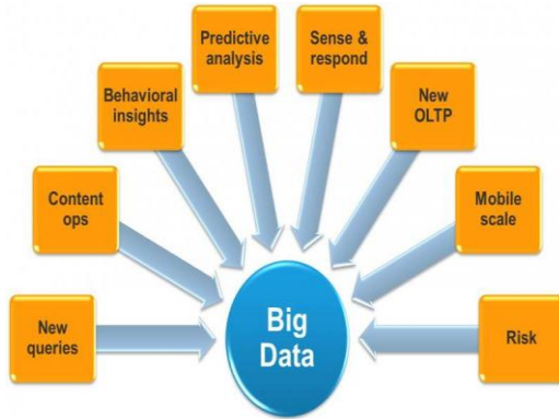
Fig.3. Big Data Evolution

Virality is described as how fastly the information is distributed across people to people networks (P2P) networks. Virality measures quick spread of data and shared to every other unique nodes. Along with rate of spread Time is a determinant factor.