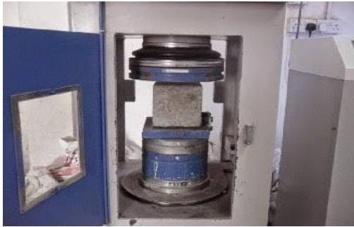
FIG-4: COMPRESSIVE STRENGTH TEST