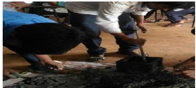
FIG -1: CASTING OF CUBES

The cubes are demoulded after 1 day of casting and then kept in respective water for curing at room temperature with a relative humidity of 85% the cubes are taken out from curing after 7, 14, 21 & 28 days for testing. The demolished concrete has been collected from the ongoing demolishing activities in Pragati Engineering College campus, Surampalem.