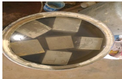
FIG -2: CURING OF CUBES