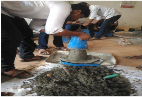
FIG -3:SLUMP CONE TEST