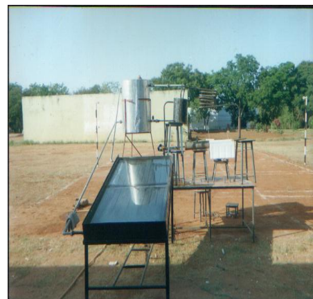
Fig.1 (a) Experimental set-up of Solar Cooling System

The aqua-ammonia cooling system consists of the components: generator, absorber, evaporator, condenser and solution heat exchanger. Generator is nothing but a cylinder made up of MS material with a diameter of 300 mm and a length of 400 mm. Inside the generator, a hollow helical coil is provided with MS pipe of 12.5 mm diameter. The outlet of refrigerant vapour from generator is connected to the condenser. Condenser is made up of 12.5 mm diameter MS pipe which is in coiled shape. The other end of the condenser is connected to the receiver tank. A receiver tank is nothing but a small cylinder of 50 mm diameter and 100 mm length which is made up of MS. Capillary tube is a pipe of small diameter of about 6 mm which connects the receiver tank and evaporator. Evaporator is a made up of 12.5 mm diameter MS pipe which is wounded in coil shape. The evaporator is located in a box which contains water. The refrigeration effect is produced inside the box. Capillary tube is connected to the inlet of the evaporator. The outlet of the evaporator is connected to the absorber. Absorber is a cylinder which is made up of MS with 100 mm in diameter and 300 mm in length. . It also has a provision to pour aqua ammonia solution which is later closed with a valve after filling the absorber. The outlet of the absorber is connected to the pump. The absorber is fully closed without any leakage. The pump lifts the solution from absorber to the generator. The pump is a fractional HP pump.